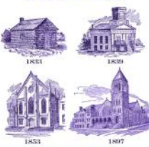
St. Luke's United Methodist Church