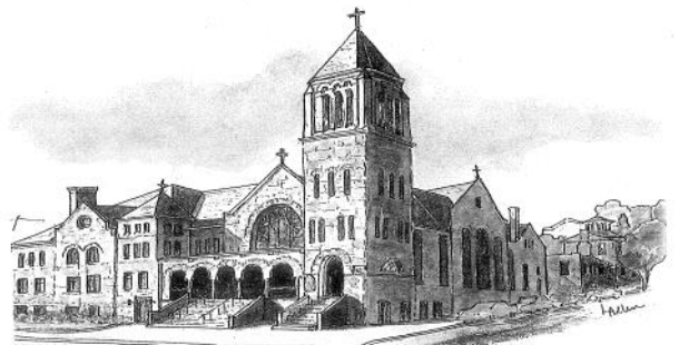
SAINTE LUCAS UNITED METHODIST CHURCH — DUBUQUE, IOWA —