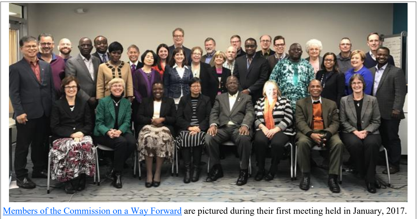
Members of the Commission on a Way Forward are pictured during their first meeting held in January, 2017.