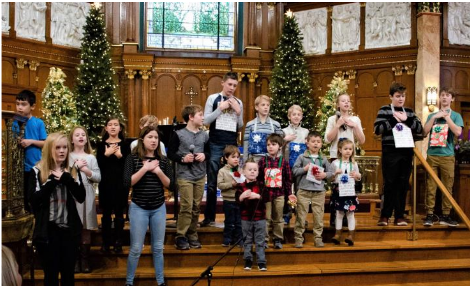
St. Luke's youth participate in last week's Christmas Program