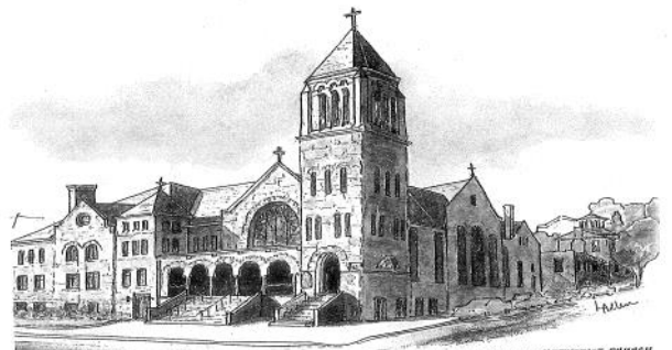
SAINTE LUKE'S UNITED METHODIST CHURCH — DUBUQUE, IOWA —