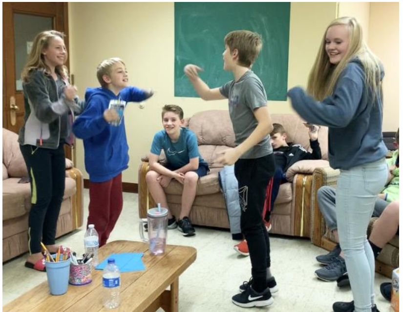
St. Luke's Confirmation Class

Are you looking for something to do on Sunday nights? Look no further! St. Luke's Jr. High and Sr. High Youth Groups are kicking off this Sunday night! Join us on Sunday nights, 7pm-8pm for fun, friends, and fellowship. We will play games, eat snacks, dig into the Bible, and talk about what it means to be a Christian in Jr. High and High School! We look forward to seeing you there! (Don't forget to bring a friend!)