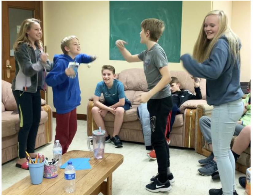
St. Luke's Confirmation Class

Are you looking for something to do on Sunday nights? Look no further! St. Luke's Jr. High and Sr. High Youth Groups are kicking off this Sunday night! Join us on Sunday nights, 7pm-8pm for fun, friends, and fellowship. We will play games, eat snacks, dig into the Bible, and talk about what it means to be a Christian in Jr. High and High School! We look forward to seeing you there! (Don't forget to bring a friend!)