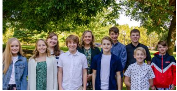
St. Luke's UMC 2020 Confirmation Class

Director of Children's, Youth, and Media Ministries